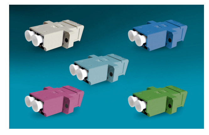
Image 2: LCD adapters in SC simplex size as offered from Datwyler – on the left side in beige for OM1 and OM2, turquoise for OM3, heather violet for OM4; on the right side for single-mode OS2 in blue (PC) and green (APC).